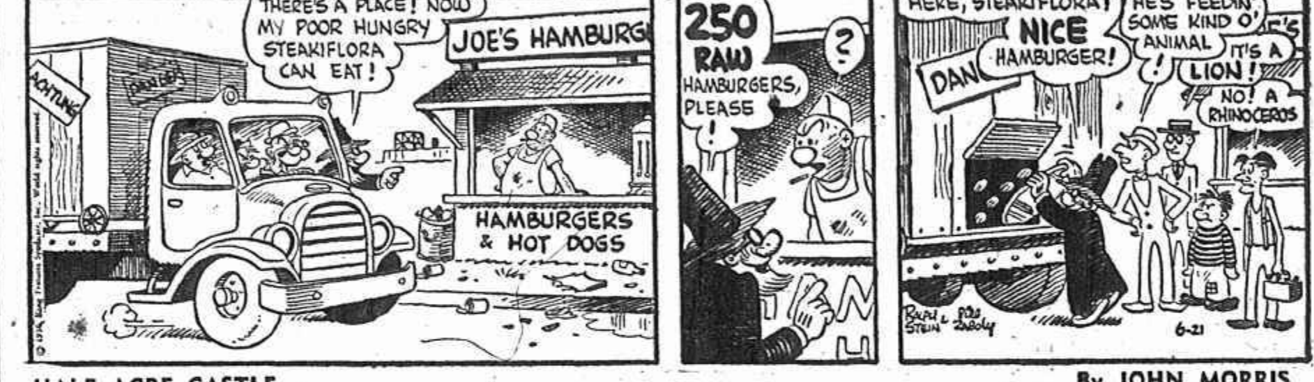
HALF ACRE CASTLE