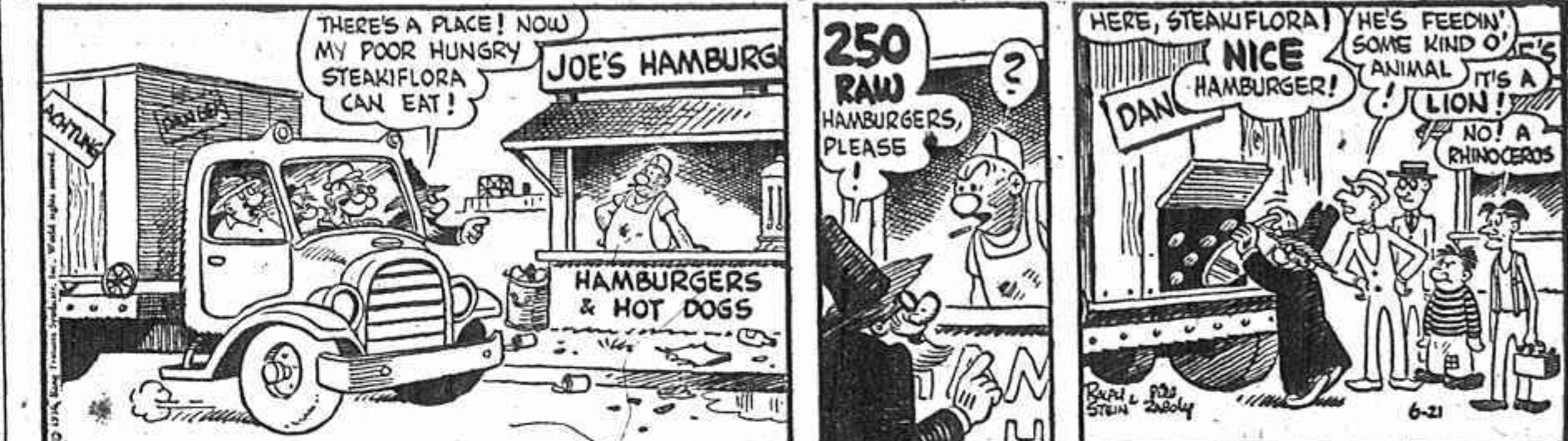
HALF ACRE CASTLE