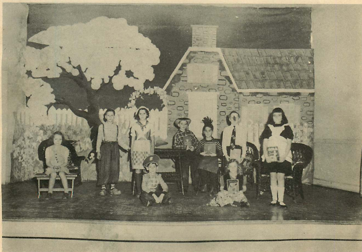
Book Week in Grade 4 25