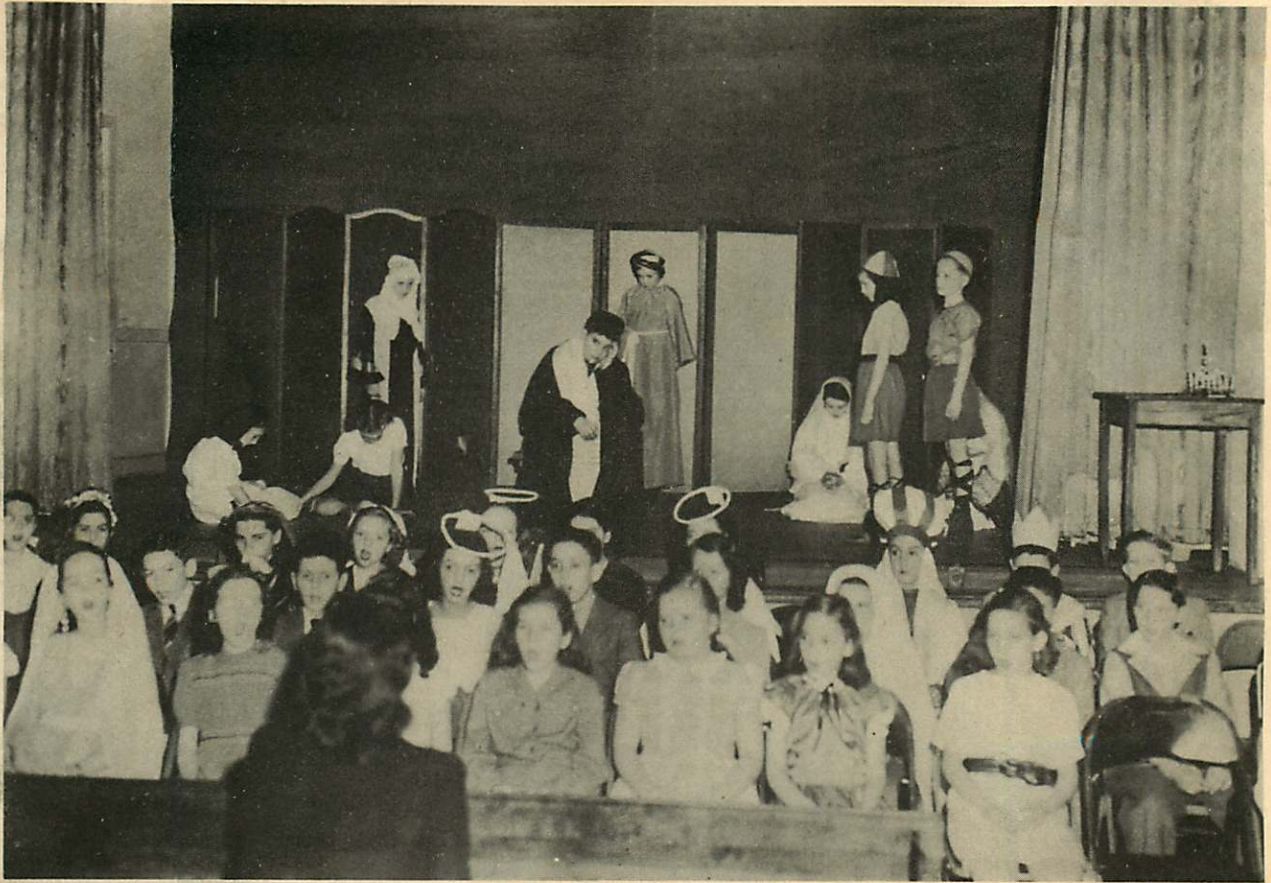
↓ THE SIXTH GRADES DRAMA