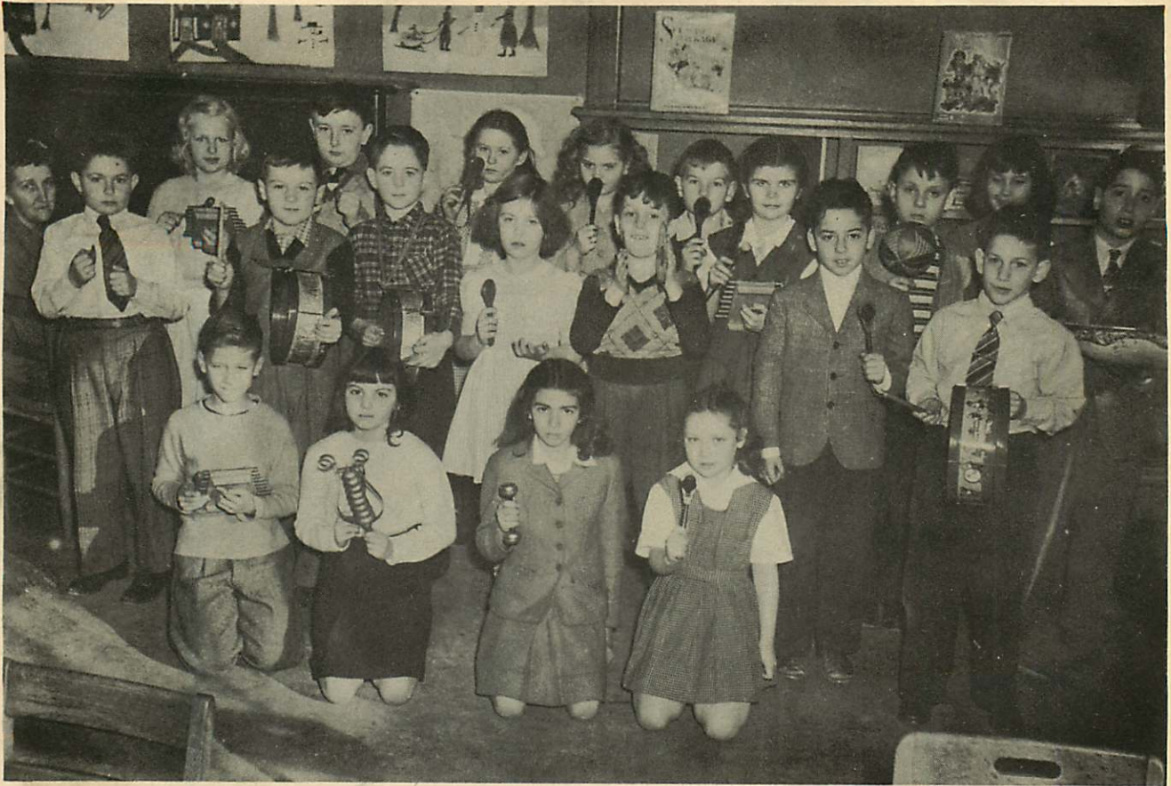
↓ Grade 3 34 has its own band ↑