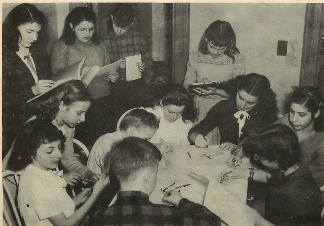
Grade 6 30 produces a School Newspaper!