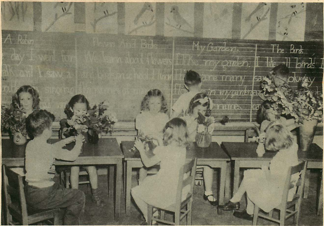
Grade 1 21 has a Flower Show among their Buds and Flowers!