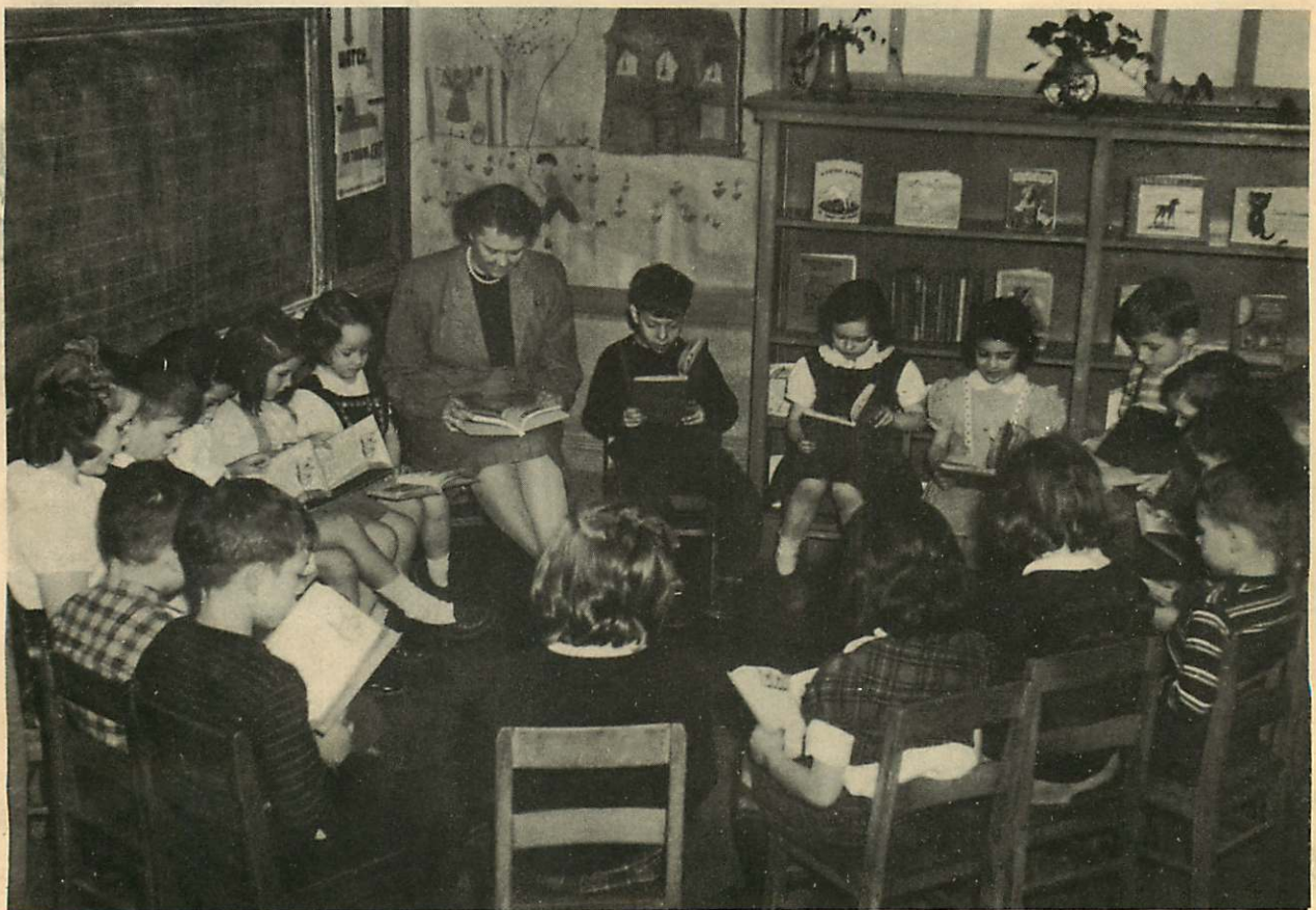
Grade 1 22 starts using Basal Readers!