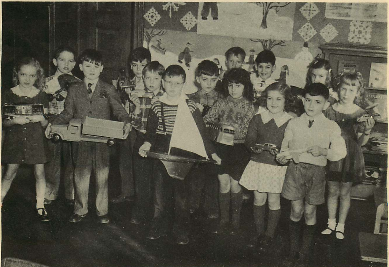
Grade 2 24 owns transportation of its own