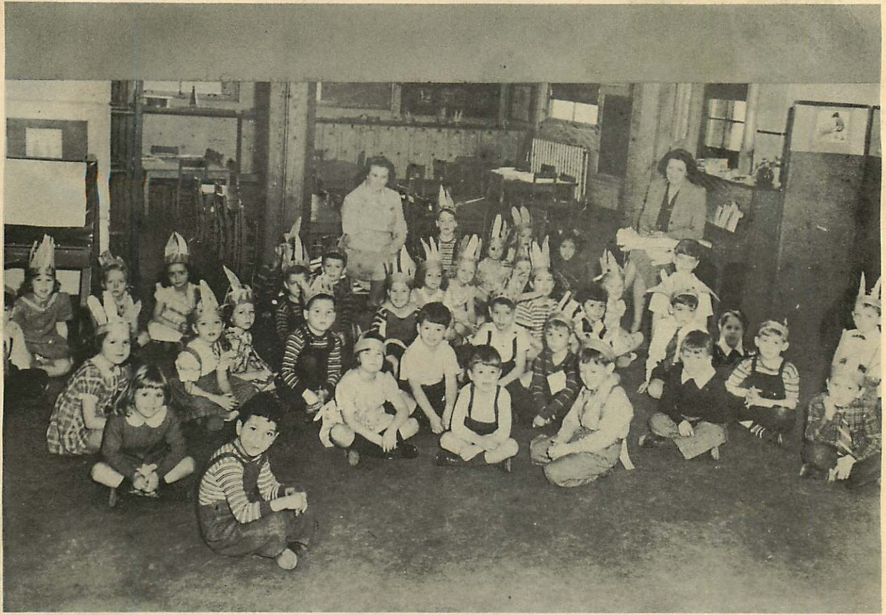
Real Indians in the Kindergarten