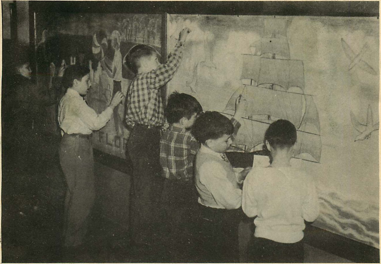
Grade 5 32 makes its own murals