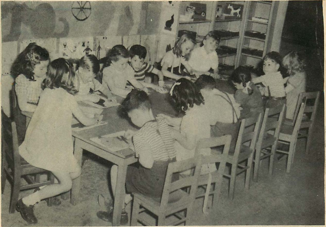
↓ Circus Time in Grade I !! ↑