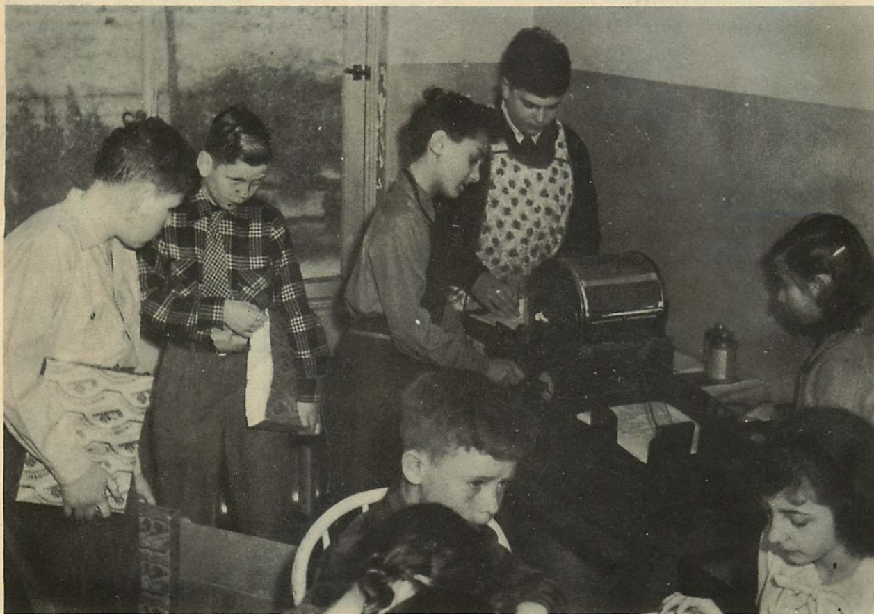
6 30 's newspaper goes to press