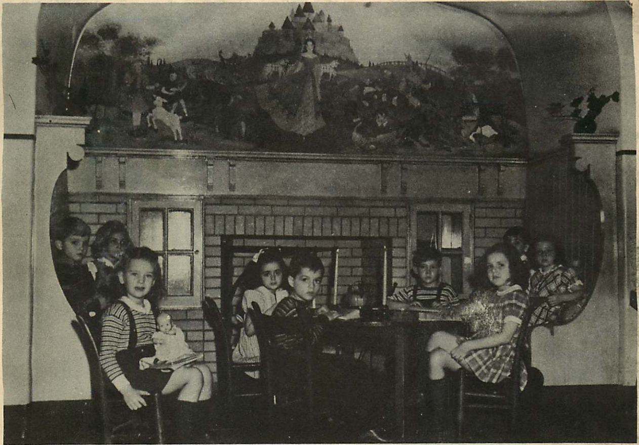
Relaxing in the Kindergarten