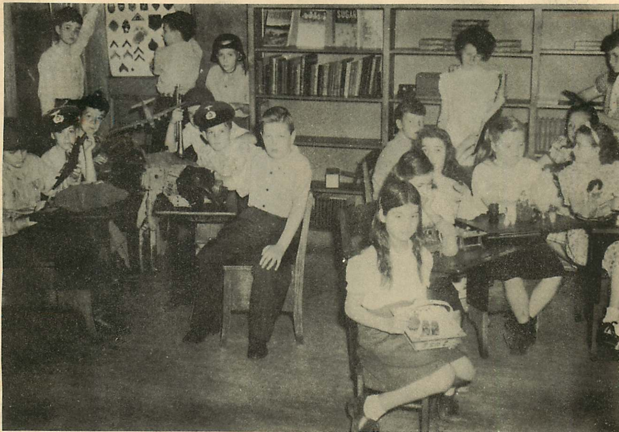
YOUTH WEEK BRINGS OUT