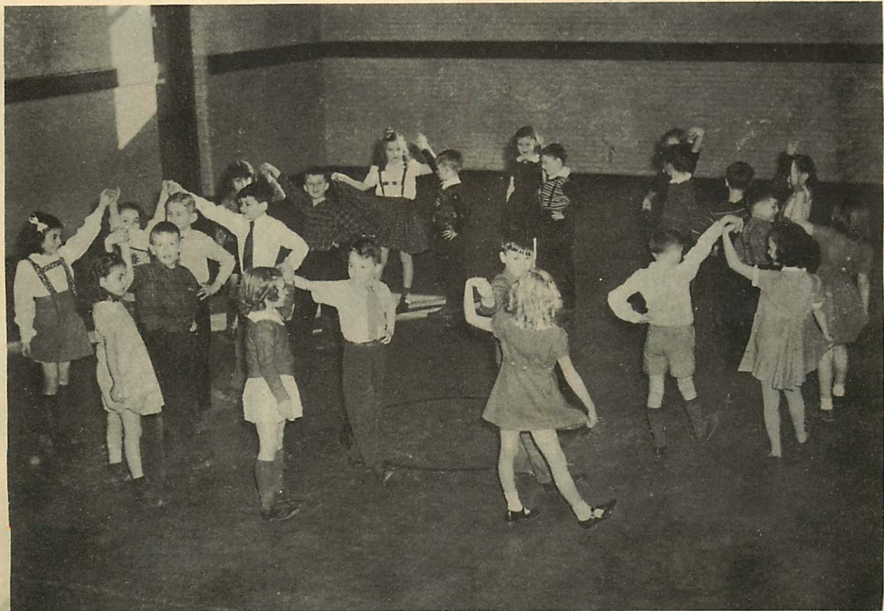
Grade 2 24 takes a bow