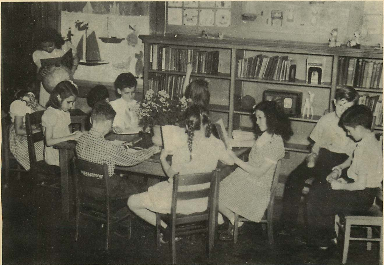
Grade 4 25 takes time for research