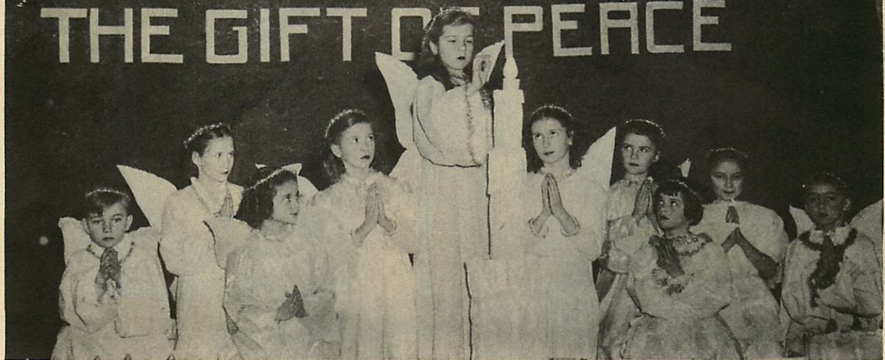
Lighting a Christmas Candle to World Peace