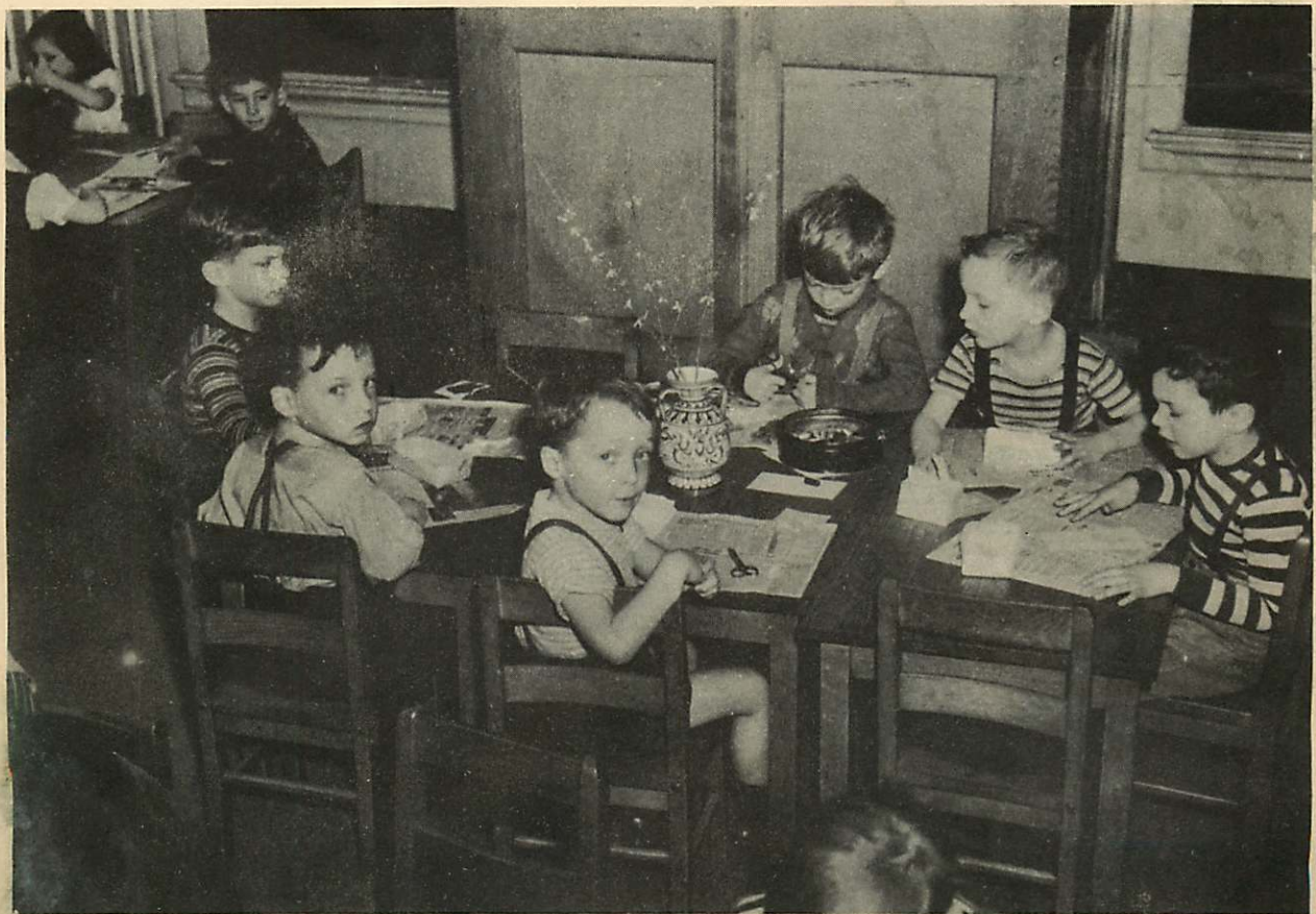
Work time in the Kindergarten