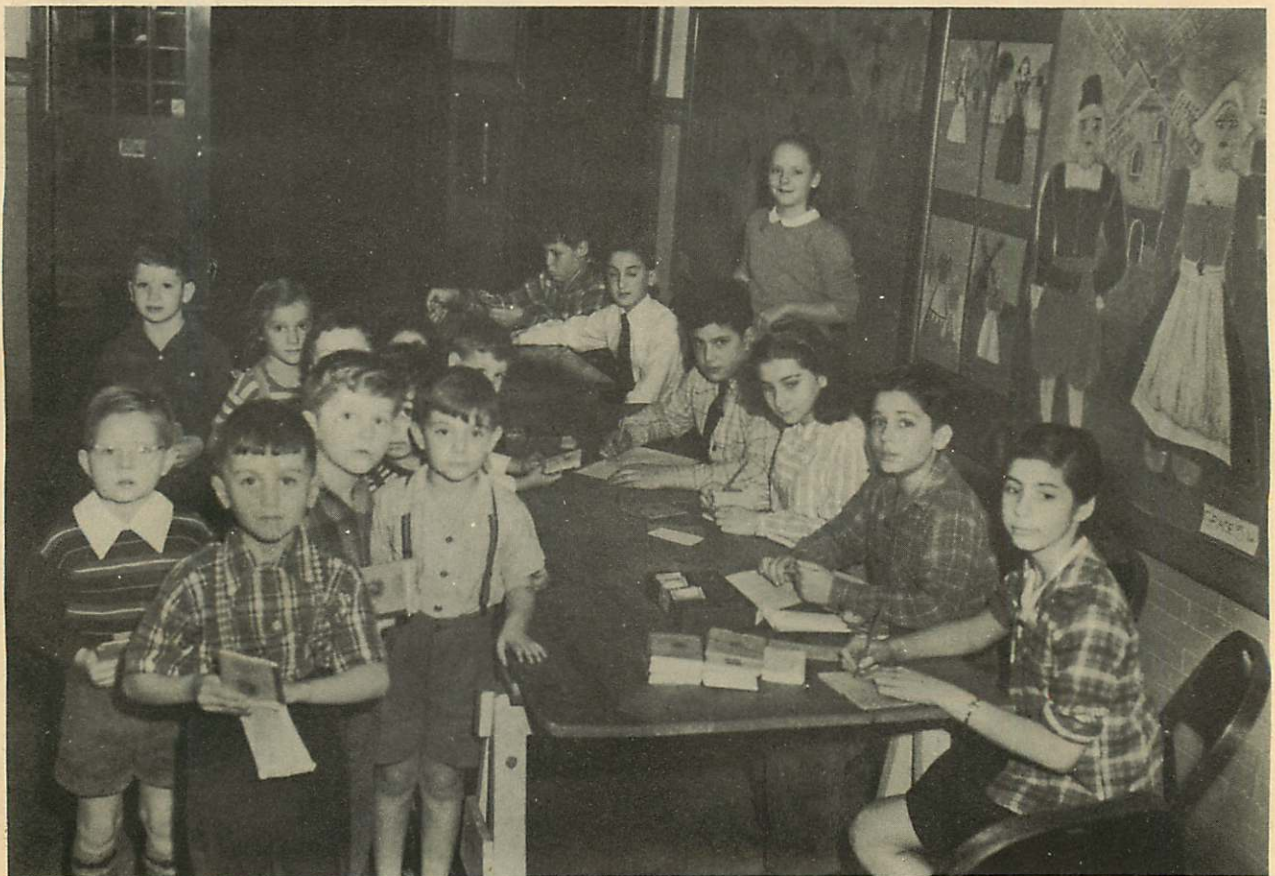
Bank Day at School 21