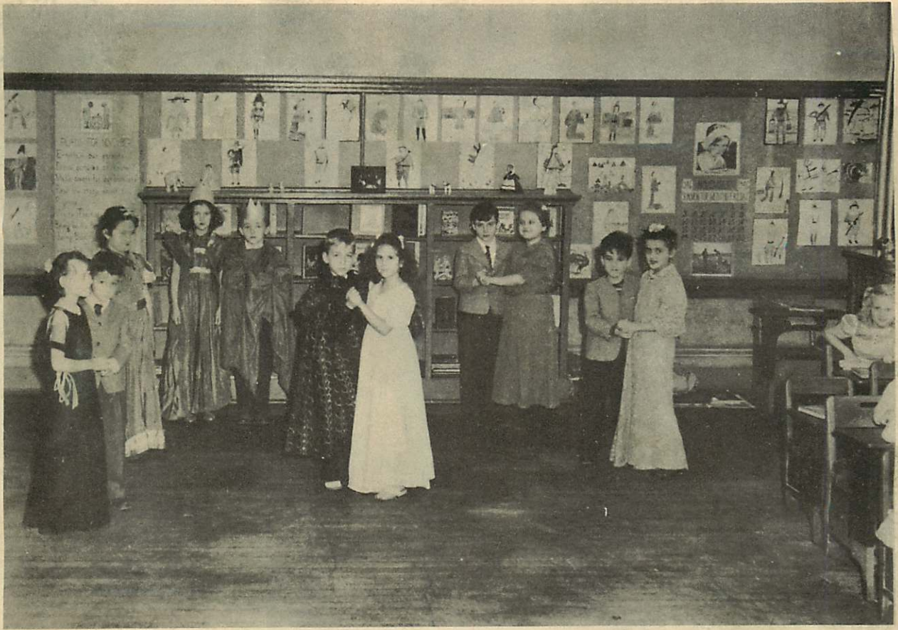
Grade 2 23 has a Cinderella Play!