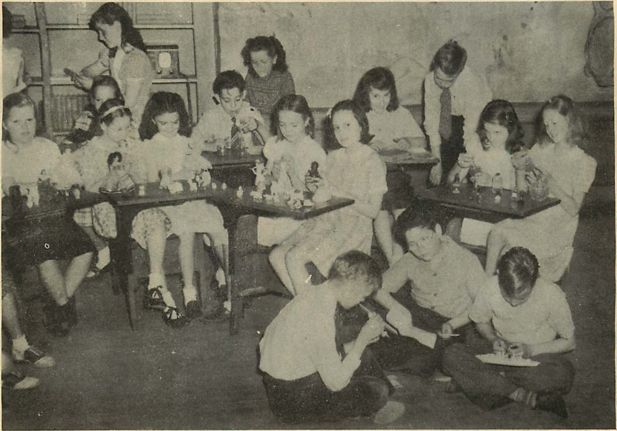
THE HOBBIES IN GRADE 5 33