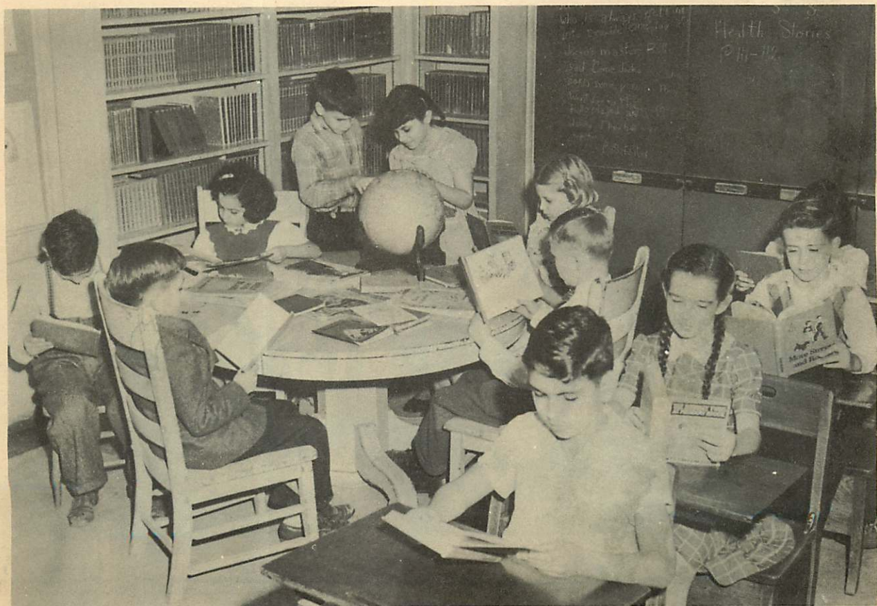
Finding out things in Grade 3 10