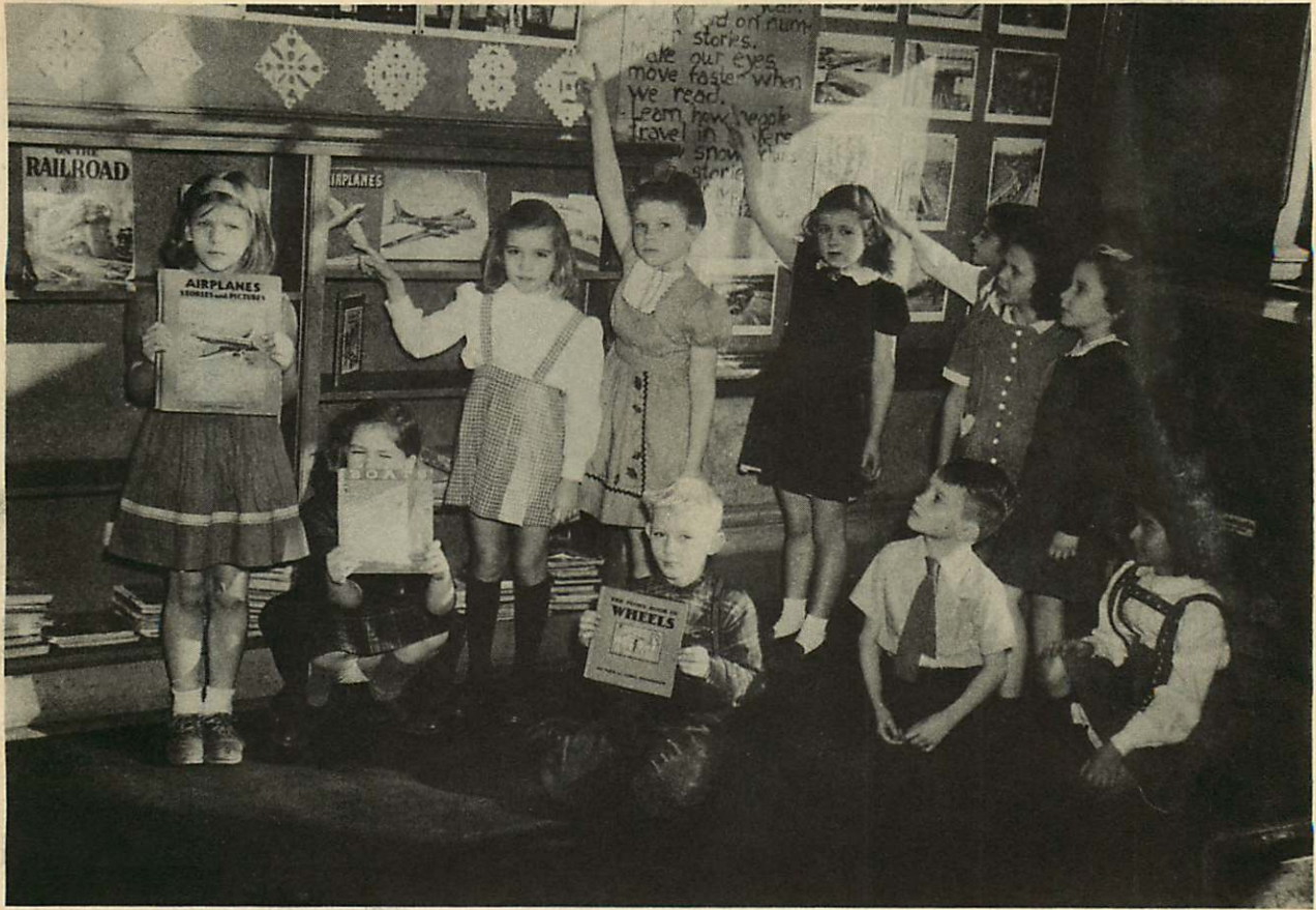
Grade 2 24 studies transportation