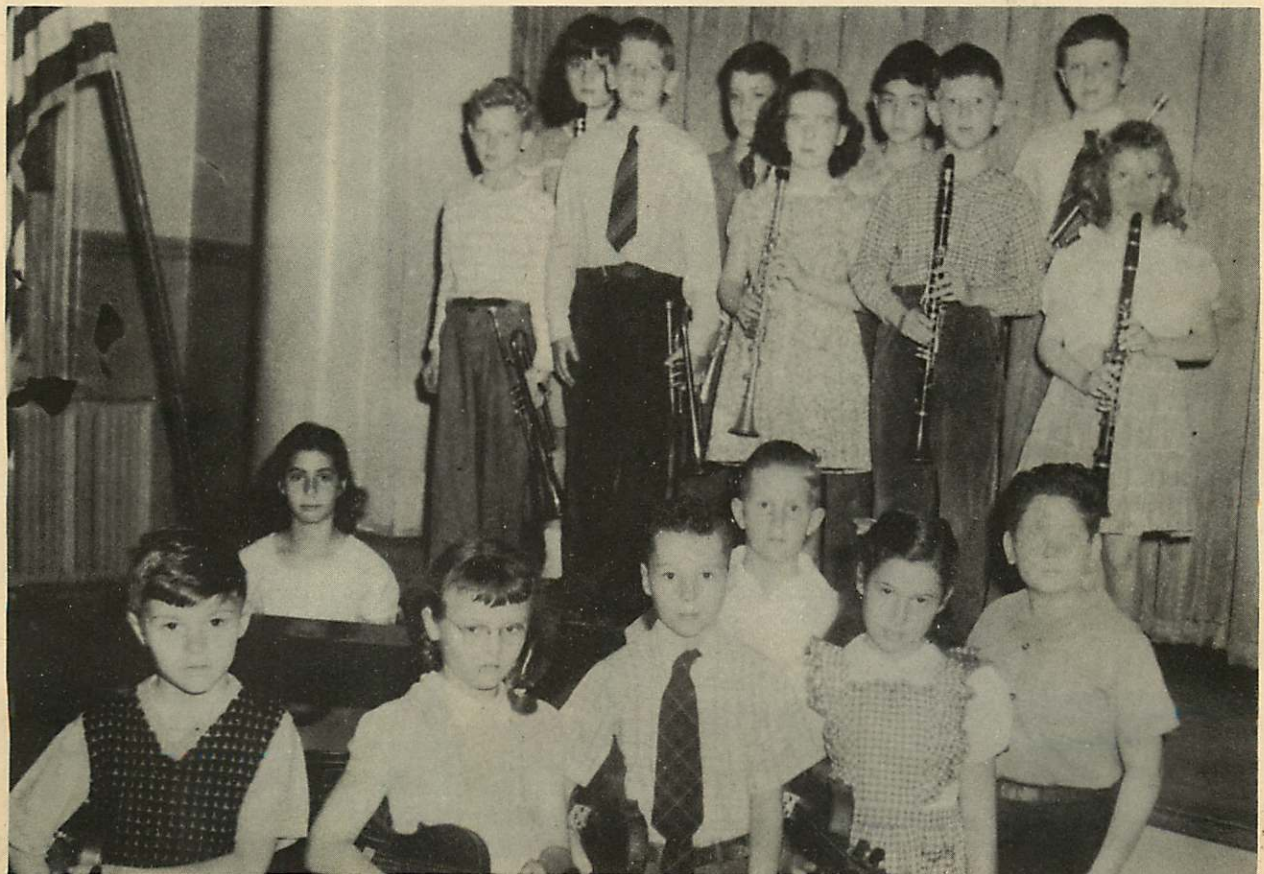
SCHOOL 21 BEGINS TRAINING A SCHOOL ORCHESTRA