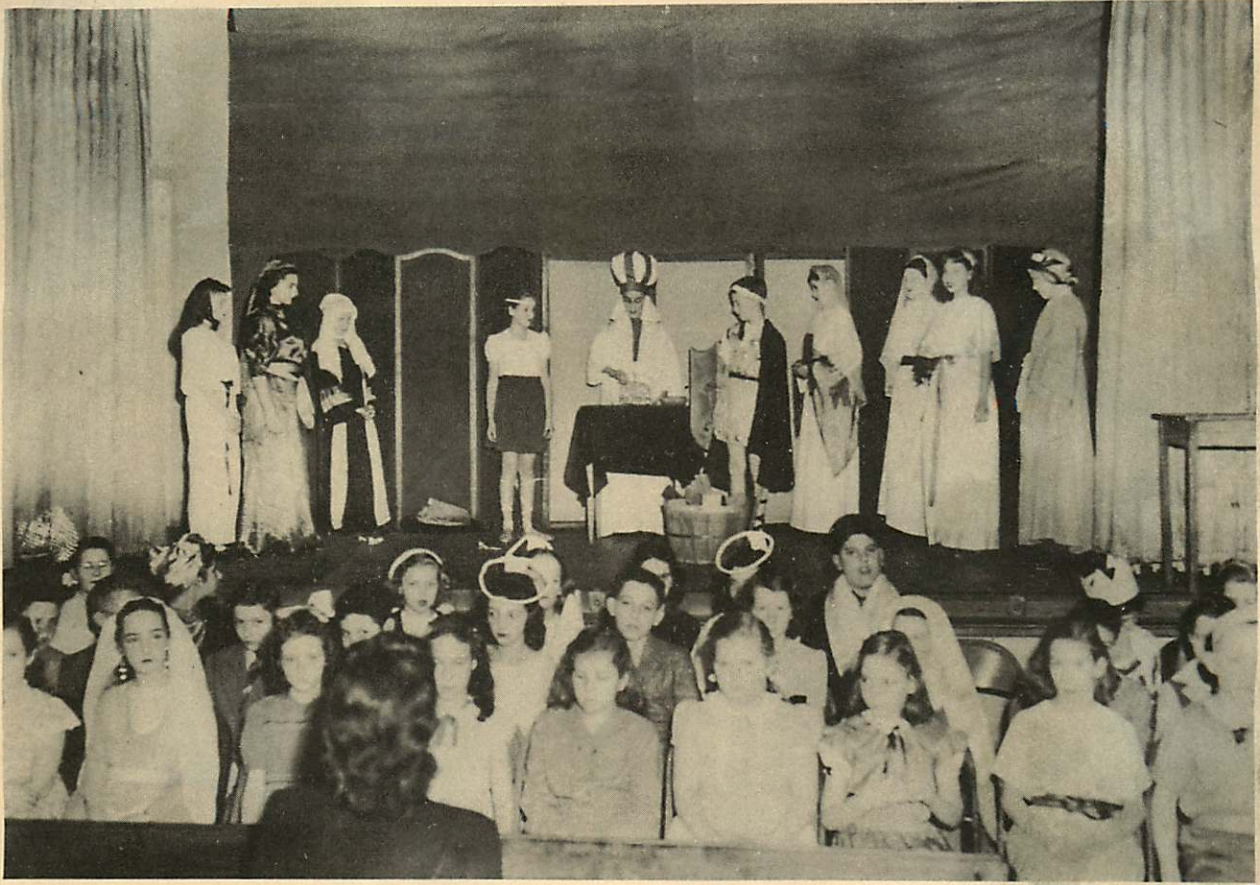
TIZE THE FESTIVAL OF LIGHTS ↑