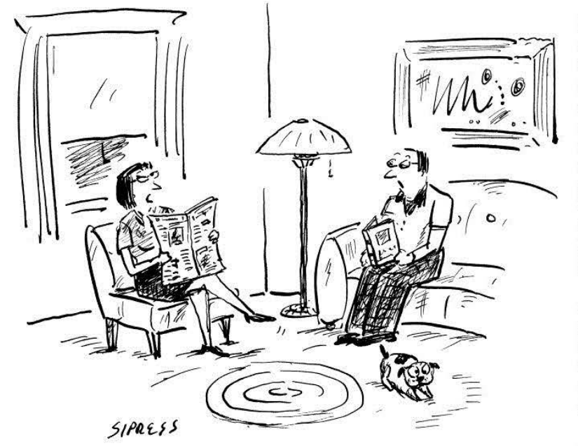
"I'm bored—let's buy a house in the country that has lots of problems."

To say that the merged firm lacked a cohesive culture was an understatement. Not only did the lawyers in the respective firms not know each other; there were lingering suspicions on the Dewey side that LeBoeuf lacked prestige, and on the Le-Boeuf side that unproductive Dewey partners would be siphoning off profits. A hastily organized cocktail party for the partners to get to know each other was